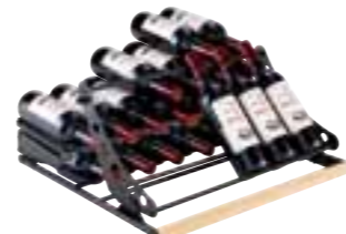
display shelves up to 32 bottles

The space between the shelves is designed to protect your bottle labels, especially those of Champagne bottles.