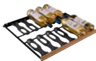
Sliding shelves up to 12 bottles