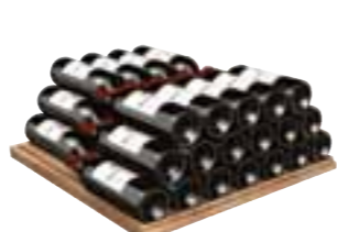
storage shelves up to 77 bottles